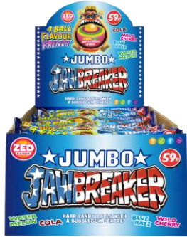
CODE: BB0162 JUMBO JBREAK QTY: 20X59P INVOICE: £7.47