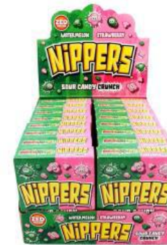
CODE: B316575 Nippers Watermelon & Strawberry QTY: 16x£1.00 INVOICE: £10.13