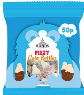
CODE: B312096 FC BOTTLES QTY: 20X50P INVOICE: £6.40