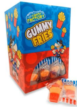
CODE: B313188 GUMMY FRIES QTY: 100X15P INVOICE: £8.75