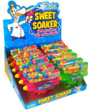
CODE: B13736 SWEET SOAKER QTY: 12X£1.29 INVOICE: £10.32