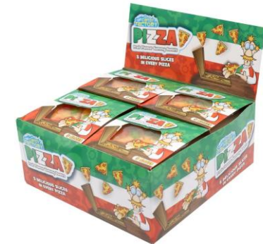
CODE: B313933 GUMMY PIZZA QTY: 24X39P INVOICE: £6.24