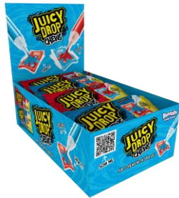
CODE: 02896 JD CHEWS QTY: 16X£1.55 INVOICE: £15.71