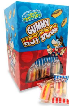
CODE: B313185 GUMMY HOT DOGS QTY: 100X15P INVOICE: £8.75