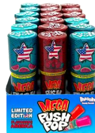
CODE: 02963 MEGA PUSH POP QTY: 18X£1.29 INVOICE: £14.70