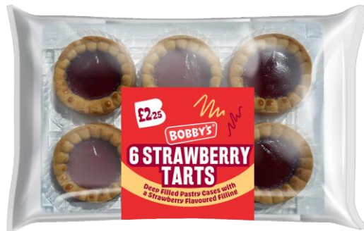
CODE: 03089 STRAWBERRY TARTS QTY: 1X£2.25 INVOICE PRICE: £1.76