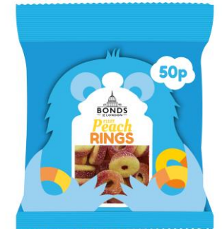
CODE: B312092 PEACH RINGS QTY: 20X50P INVOICE: £6.40