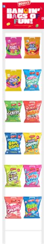
9042 12-HOOK STAND 9044 12-HOOK HEADER

USE ME TO: DISPLAY UP TO 12 BAGS OF BOBBY'S BAGGED SWEETS RANGE. DIMENSIONS: H 1740MM, D 300MM, W 300MM.