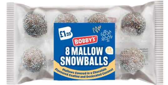
CODE: 03079 SNOWBALLS QTY: 1X£1.39 INVOICE PRICE: £1.08