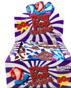
CODE: 02877 RING POP TWIST QTY: 24X50p INVOICE: £7.60