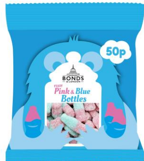
CODE: B312113 P&B BOTTLES QTY: 20X50P INVOICE: £6.40