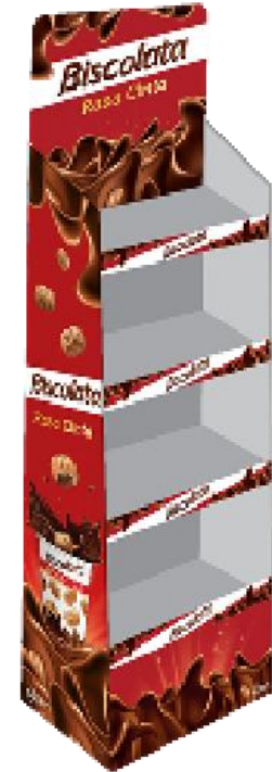
9041 BISCOLATA STAND

USE ME TO: DISPLAY BOBBY'S LARGE RANGE OF BISCOLATA. GREAT FOR DISPLAYING NEAR IMPULSE LOCATIONS. DIMENSIONS: H 1500MM, D 430MM, W 690MM.