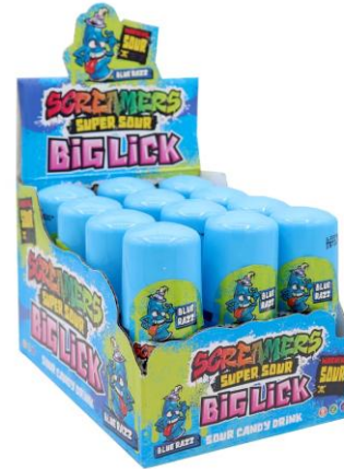
CODE: B313480 BIG LICK BR QTY: 12X£1.00 INVOICE: £8.00