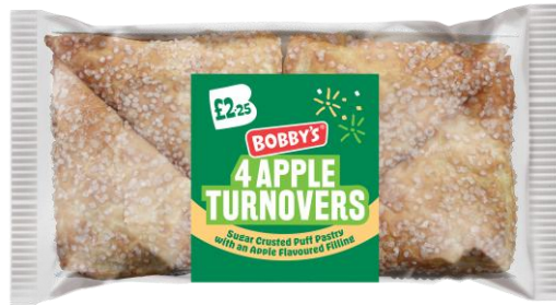
CODE: 03088 APPLE TURNOVERS QTY: 1X£2.25 INVOICE PRICE: £1.76