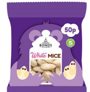
CODE: B312110 WHITE MICE QTY: 20X50P INVOICE: £6.40