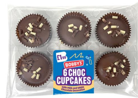
CODE: 02965 CHOC CUPCAKES QTY: 1X£1.99 INVOICE PRICE: £1.55