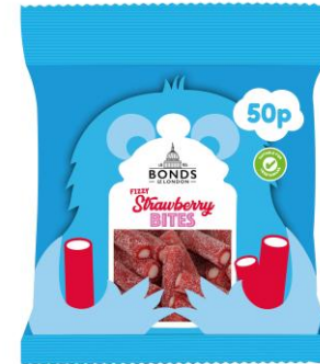
CODE: B312089 STRAWB BITES QTY: 20X50P INVOICE: £6.40