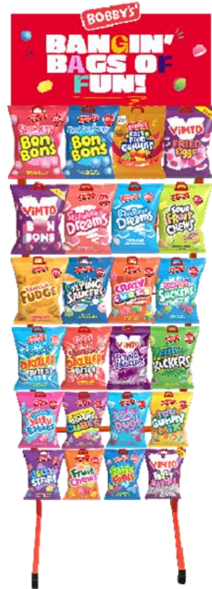
9039 24-HOOK STAND 9046 24-HOOK HEADER

USE ME TO: DISPLAY UP TO 12 BAGS OF BOBBY'S BAGGED SWEETS RANGE. DIMENSIONS: H 1740MM, D 300MM, W 300MM.