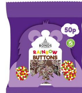
CODE: B312105 RAINB BUTTONS QTY: 20X50P INVOICE: £6.40