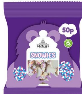
CODE: B312085 SNOWIES QTY: 20X50P INVOICE: £6.40