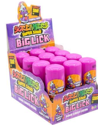
CODE: B313481 BIG LICK PR QTY: 12X£1.00 INVOICE: £8.00