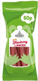
CODE: B312146 S STRAWB LANCE QTY: 24X50P INVOICE: £7.68