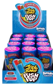
CODE: 03039 TRIPLE PUSH POP QTY: 12X£1.85 INVOICE: £14.06