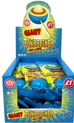
CODE: BB0069 BR JAWBREAK QTY: 15X£1.00 INVOICE: £9.75