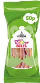
CODE: B312148 RAINB BELTS QTY: 24X50P INVOICE: £7.68