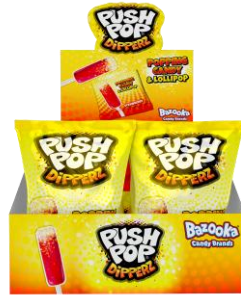
CODE: 02898 PUSH POP DIPPERZ QTY: 48X35p INVOICE: £10.64