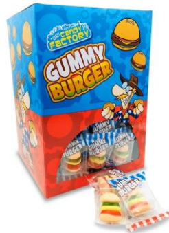
CODE: B313186 GUMMY BURGERS QTY: 100X15P INVOICE: £8.75