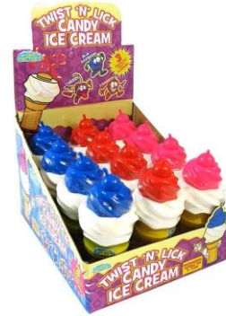
CODE: B33849 TNL ICE CREAM QTY: 12X£1.29 INVOICE: £9.80