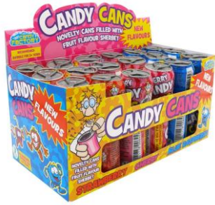
CODE: B10475 CANDY CANS QTY: 36X39P INVOICE: £9.36