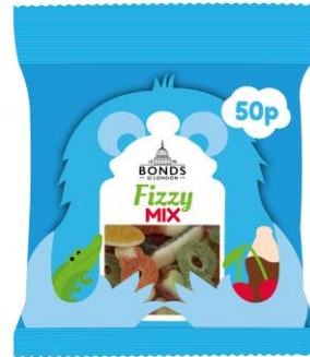
CODE: B312087 FIZZY MIX QTY: 20X50P INVOICE: £6.40