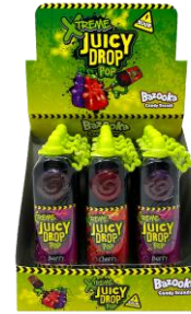
CODE: 02892 JD POP XTREME QTY: 12X£1.55 INVOICE: £11.78