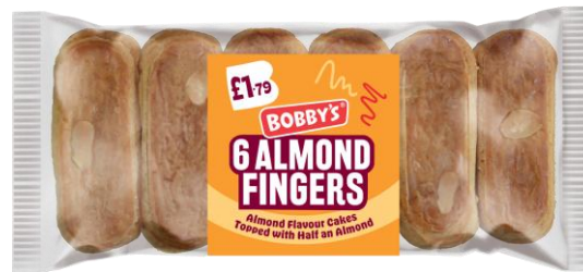
CODE: 03087 ALMOND FINGERS QTY: 1X£1.79 INVOICE PRICE: £1.40