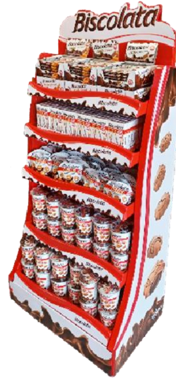
9016 BISCOLATA FAMILY STAND

USE ME TO: DISPLAY UP TO 24 BAGS OF BOBBY'S BAGGED SWEETS RANGE. DIMENSIONS: H 1810MM, D 520MM, W 390MM.