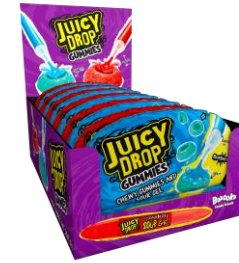
CODE: 02895 JD GUMMIES QTY: 12X£1.55 INVOICE: £11.78