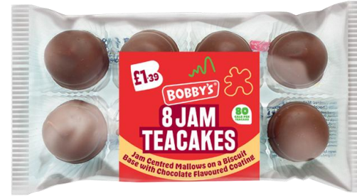
CODE: 03080 JAM TEACAKES QTY: 1X£1.39 INVOICE PRICE: £1.08