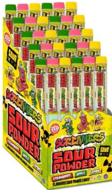
CODE: B314618 SOUR POWDER QTY: 30X40P INVOICE: £7.60