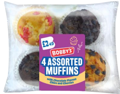
CODE: 03070 ASSORTED MUFFINS QTY: 1X£2.49 INVOICE PRICE: £1.95