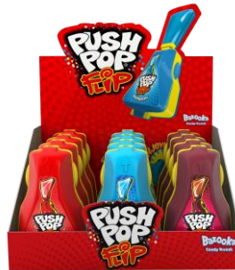
CODE: 02878 PUSH POP FLIP QTY: 12X£1.69 INVOICE: £12.84