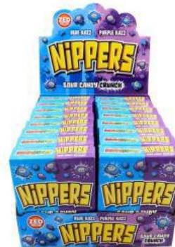
CODE: B316575 Nippers Blue & Purple Razz QTY: 16x£1.00 INVOICE: £10.13