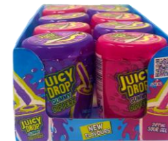
CODE: 03011 JD GUMMY DIP QTY: 8X£1.99 INVOICE: £10.08