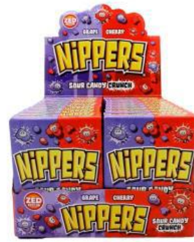
CODE: B316576 Nippers Grape & Cherry QTY: 16x£1.00 INVOICE: £10.13