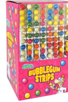
CODE: B40582 BGUM STRIPS QTY: 40X40P INVOICE: £10.67